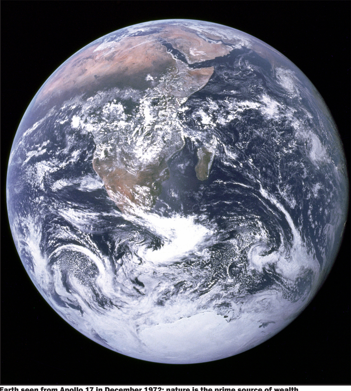
Earth seen from Apollo 17 in December 1972: nature is the prime source of wealth

Hence this question: "Where does wealth come from?" Answer: "Wealth under capitalism appears as a collection of stuff - commodities." Workers, of course, produce that "stuff" using the means of production owned by the capitalist class and are