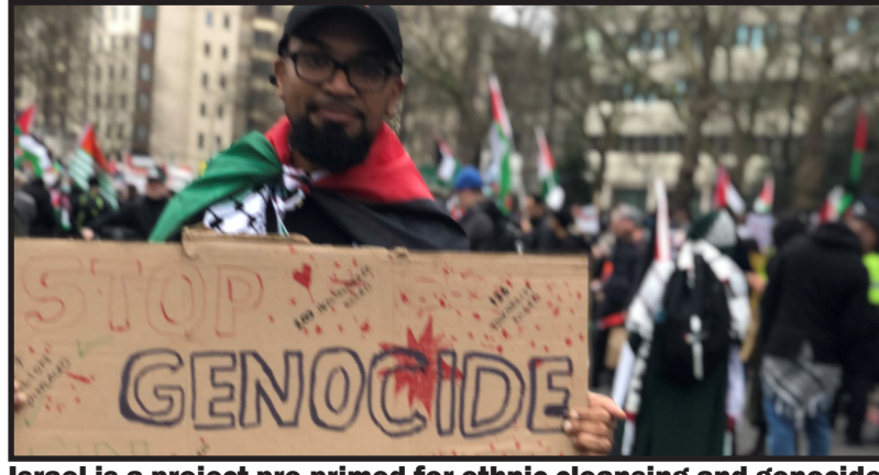
Israel is a project pre-primed for ethnic cleansing and genocide

However, there is a second, extremely important reason why the two-state solution cannot happen, which is logistics. If you look at the map of Israel's settlements in the occupied Palestinian territories, the problem immediately becomes clear. There is simply no territory on which to establish the Palestinian state. Without the Israelis being forced to remove their settlements, there is no way that what is left now of the original Palestine can form the territory of the Palestinian state.