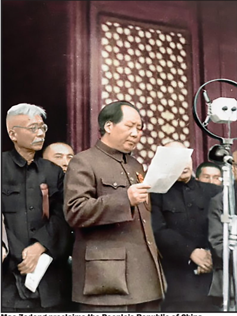
Mao Zedong proclaims the People's Republic of China

One thing is certain: that the death-hour of Old China is rapidly drawing nigh. Civil war has already divided the south from the north of the empire, and the rebel king seems to be